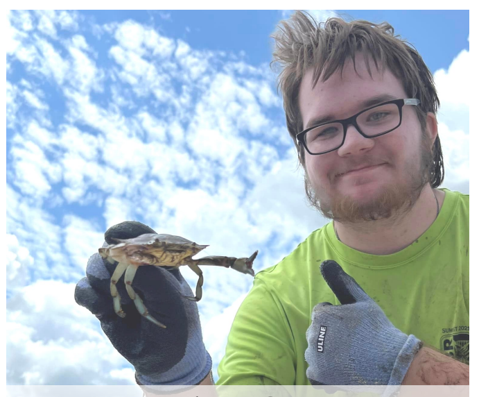
Future Bay Leaders + Summer Interns