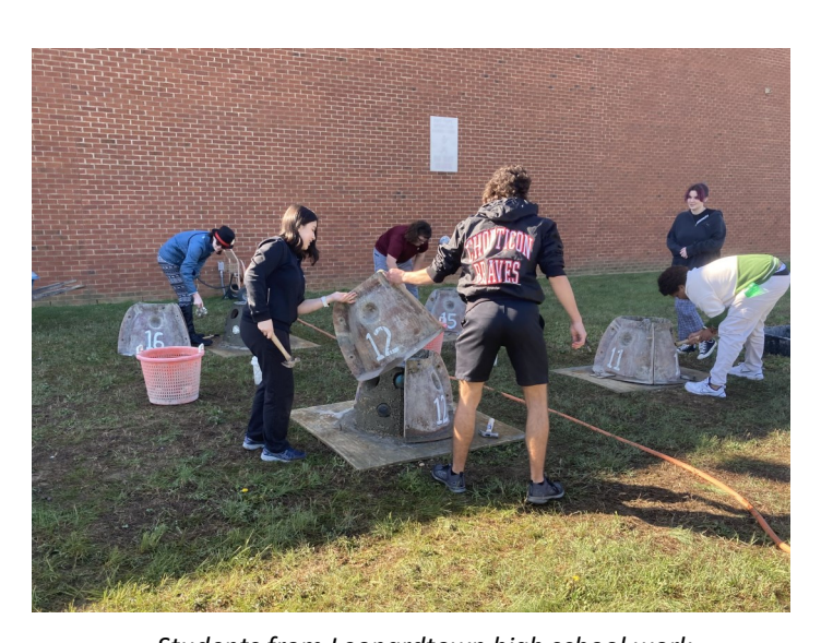
Students from Leonardtown high school work together to remove a mold from a reef ball

At each of these "builds," community members learned about historic oyster population declines, our efforts to restore oysters, and how they can help the Bay.