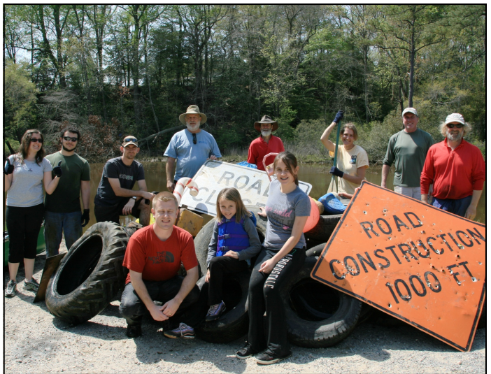
Fourth Annual St. Mary's River Clean-Up nets thirty-one tires.