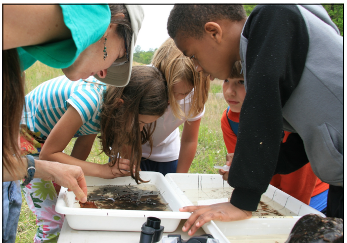
Second-graders from the Chesapeake Charter School learn about the life stages of aquatic insects.