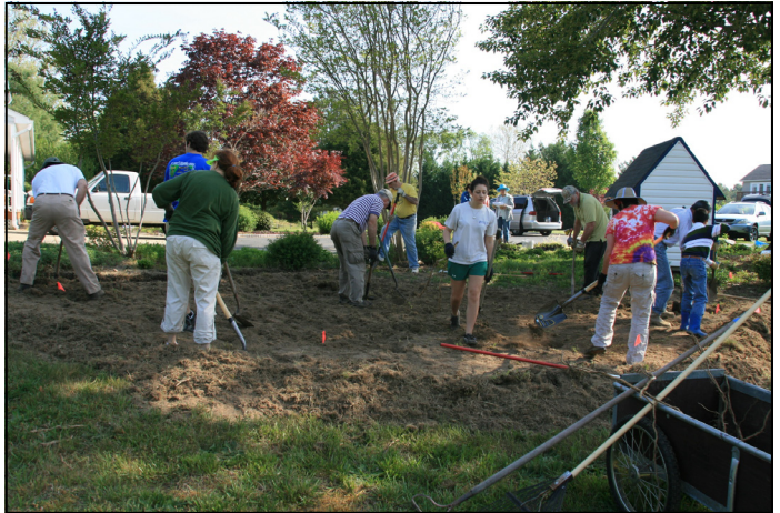
Rain Garden installation in St. Inigoes reduces polluted run-off.