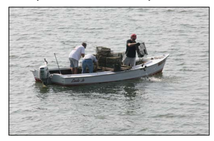
Marylanders Grow Oysters plantings on June 11-15, 2010.

Next year's program begins on September 18, 2010. From 8 a.m. until noon at St. Mary's College, we will distribute 300,000 spat-on-shell in 650 cages to more than 100 volunteer homeowners. If you are signed on, please pick up your cages. If you have not signed on, call us and become a part of Marylanders Grow Oysters. 301-862-3517