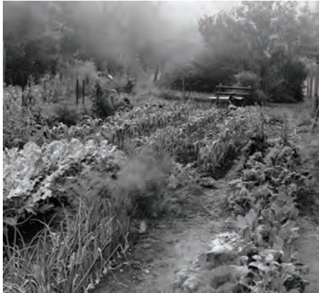
Organic vegetable patch in Park Hall.

diseases such as Campylobacteriosis, Salmonellosis, and Toxocariasis, each as unpleasant as its name.